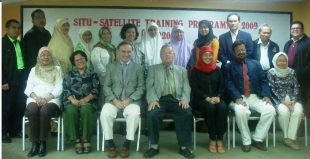
LEFT: Group photo taken during the 'In-Situ' Training Programme in Social, Health and Economic Issues of Ageing held in Malaysia between 13th—19th August 2009

Since 2007, as part of the United Nations international effort to provide multidisciplinary education and training in specific areas related to ageing, the International Institute on Ageing, United Nation-Malta, (INIA) and the Institute of Gerontology, Universiti Putra Malaysia (IG UPM) have been jointly organizing an 'in-situ' training programme which has been specifically tailored as appropriate to, and rooted in, the socioeconomic conditions and needs of the country—Malaysia. As in previous years, the International Institute on Ageing, United Nations—Malta and the Institute of Gerontology, Universiti Putra Malaysia organized the third 'in-situ' training programme in 'Social, Health and Economic Issues of Ageing' . This was held at the Awana Genting Highlands Golf and Country Resort, Pahang. The programme, which was attended by 17 government officials, was held between 13th -19th August 2009 .