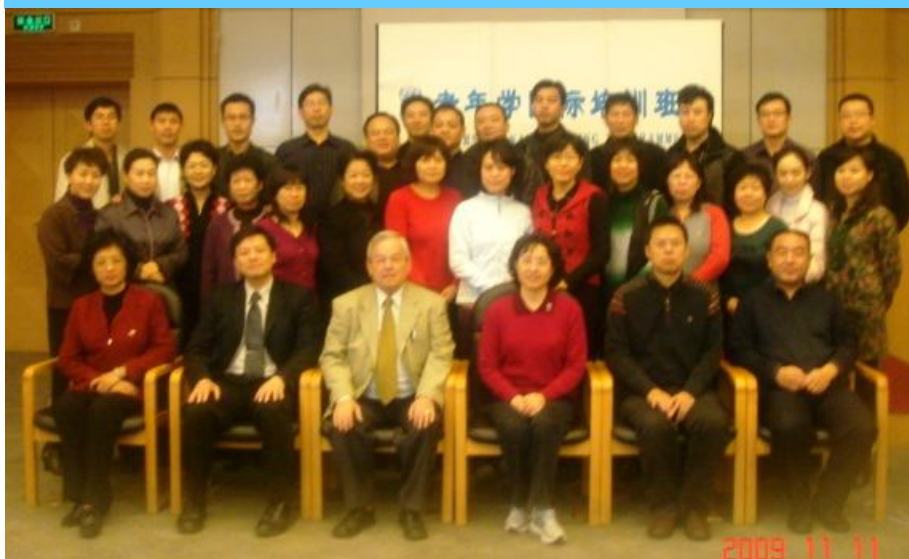
ABOVE: Group photo taken during the programme held in Beijing, in collaboration with Beijing Civil Affairs Bureau (BCAB).

The programme consisted on lectures and discussions on the social, medical and demographic aspects of ageing.