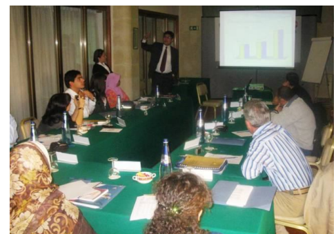
LEFT: Some of the participants at the University of Malta, during the computer lab session.