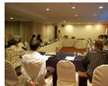
ABOVE: The participants during the programme