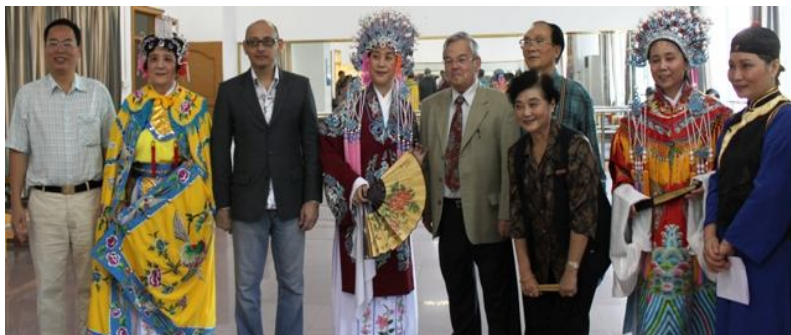
ABOVE: Chinese women dressed in the national costume. The women are learning Chinese opera at one of the Universities of the Third Age in Guangdong Province.