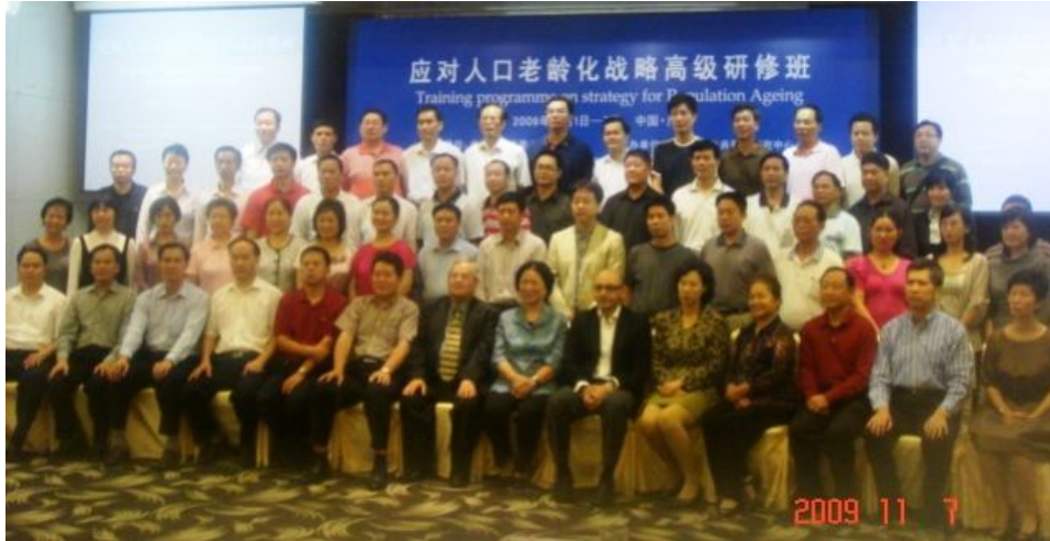
ABOVE: Group photo taken during the programme held in Guangzhou in collaboration with the Guangdong Research Center on Public Affairs for the Elderly (GRCPAE).

Programme organised in GUANGZHOU, 1st—7th November 2009