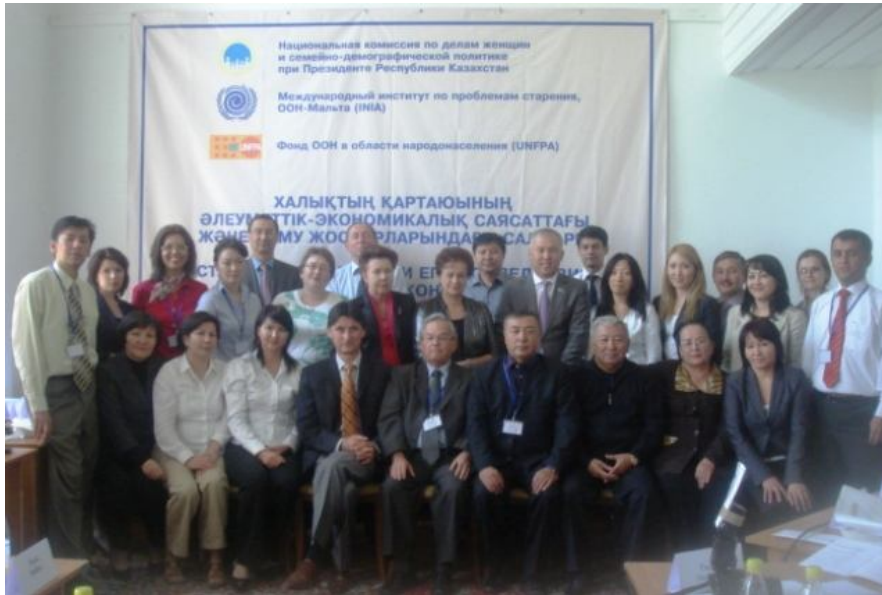
ABOVE: Group photo taken during the 'in-situ' programme held in Almaty, Kazakhstan.

The International Institute on Ageing, United Nations-Malta (INIA), in collaboration with the United Nations Population Fund (UNFPA) and the Kazakhstan National Commission on Women Affairs, organised for the FIRST time, an ' in-situ ' training programme in ' Population Ageing and its Implications for Socio-Economic Policies and Plans '. The programme, which was organised in Almaty, Kazakhstan between 14th—19th September , was the first training programme in the field of ageing to be held in Central Asia. Twenty-seven high government officials from Kazakhstan, Kyrgyzstan and Tajikistan participated, together with seven parliamentarians from the Kazakhstan government. The participatory sessions were directed by INIA's Director Professor Joseph Troisi, as well as by Dr. Nikolai Botev, UNFPA Director Central Asia Regional Office and Country Director, Kazakhstan. Other training programmes for countries in Central Asia are being planned for the future.