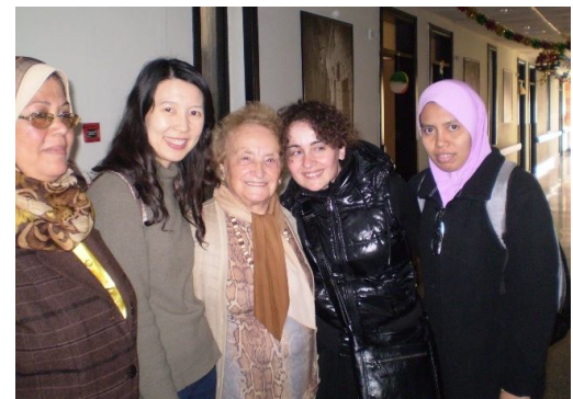
ABOVE: Some of the participants with one of the residents at Mtarfa Home for the elderly during one of the site-visits.