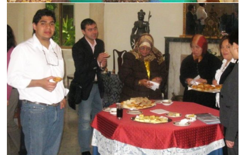
RIGHT: During the Closing ceremony reception at the Imperial Hotel, Sliema.