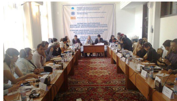
RIGHT: The participants during the programme.